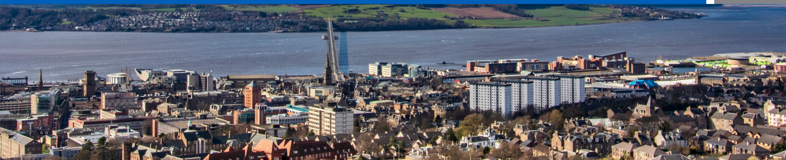
Figure 1 provides a summary of the key aspects related to the city's housing.

The data is collated from a number of sources at local and national level, for example: National Census; National Records for Scotland; Scottish Government Statistical Returns; and, Dundee: Local Housing Strategy, Strategic Housing Investment Plan.